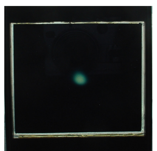
Figure 3: Observation of a bleaching damage in a stack of polarizers